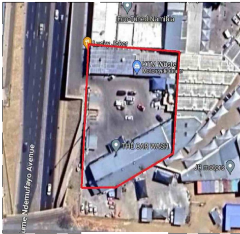
CoW Arial View